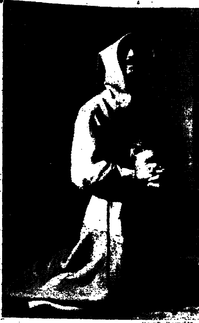
"St. Francis in Meditation."

NEW YORK — If the supreme art show is one that puts a great master in a new perspective, revealing him to have been greater still, the Zurbarán exhibition now at the Metropolitan Museum through Dec. 15, before coming to Paris on Jan. 14, must be rated as the ultimate.